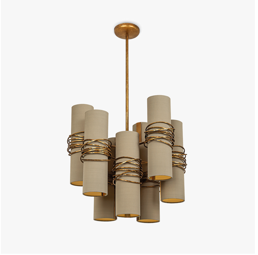
CL58 in Hammered Antique Gold with 9 Shades in Dupion 5018W/1094