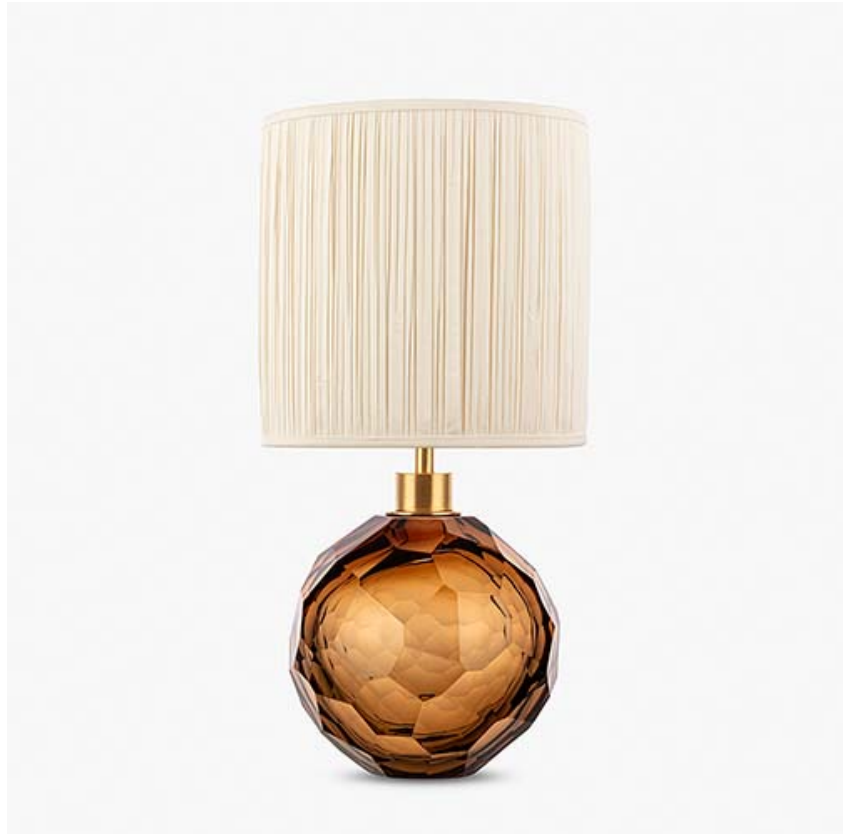
TL710-SM in Brushed Gold and Tobacco Murano Glass with 9 Inch Tall Drum Shade in Pleated James Hare 38000/01