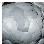
Round Petrol Blue & Clear