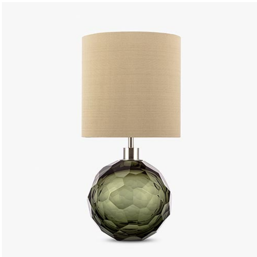
TL710-SM in Brushed Nickel and Forest Green Murano Glass with 9 Inch Tall Drum Shade in 5018W/1094