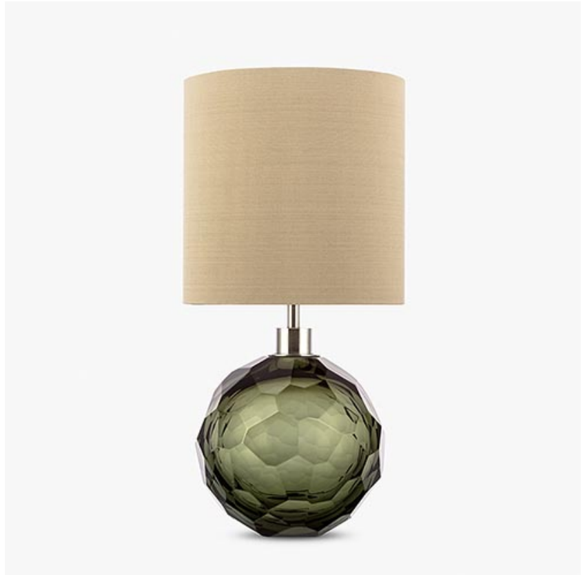
TL710-SM in Brushed Nickel and Forest Green Murano Glass with 9 Inch Tall Drum Shade in 5018W/1094