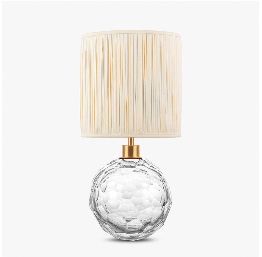
TL710-SM in Brushed Gold and Clear Glass with 9 Inch Tall Drum Shade in Pleated JH3800/01 Ivory