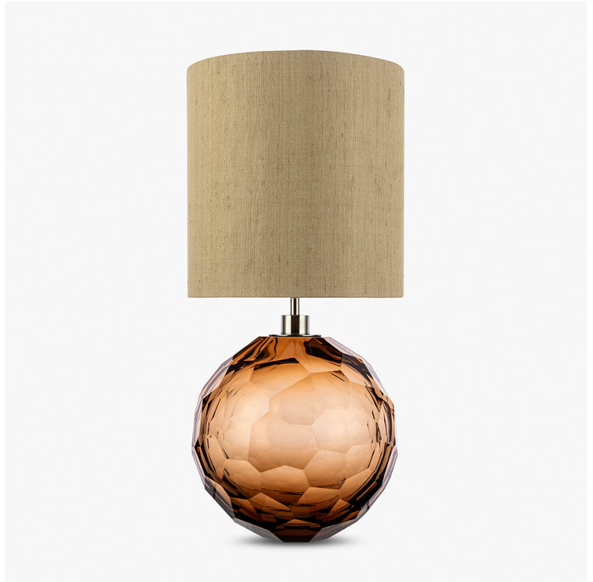
TL710-LA in Tobacco and Clear and Brushed Nickel with a 12 Inch Tall Drum Shade in 3998