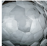
Round Petrol Blue & Clear