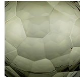
Round Forest Green & Clear