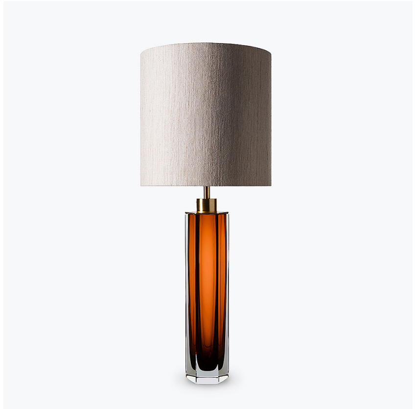
TL704-SM in Tobacco & Clear Murano Glass with a Brushed Gold Top and a 10" Tall Drum Shade in 3998/ W White