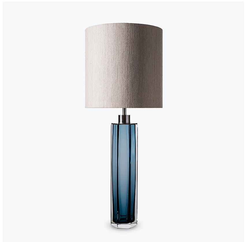
TL704-SM in Petrol Blue & Clear Murano Glass with a Brushed Nickel Top and a 10" Tall Drum Shade in Silk Linen 3998/ W White