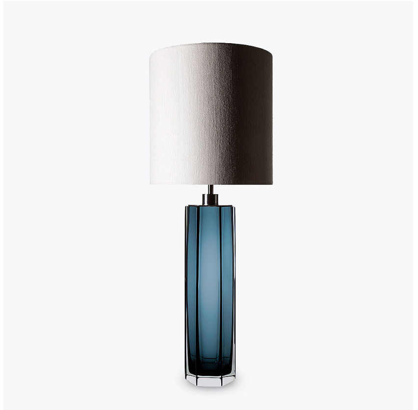
TL704-LA in Petrol Blue and Clear with a Brushed Nickel Top and a 12" Tall Drum Shade in Silk Linen 3998/ W White