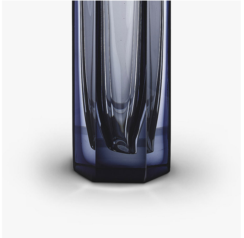
TL704 in Petrol Blue Murano Glass with a 16" Drum Shade in Silk Crepe Satin 1806W/ 86 Prussian