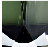
Forest Green & Clear