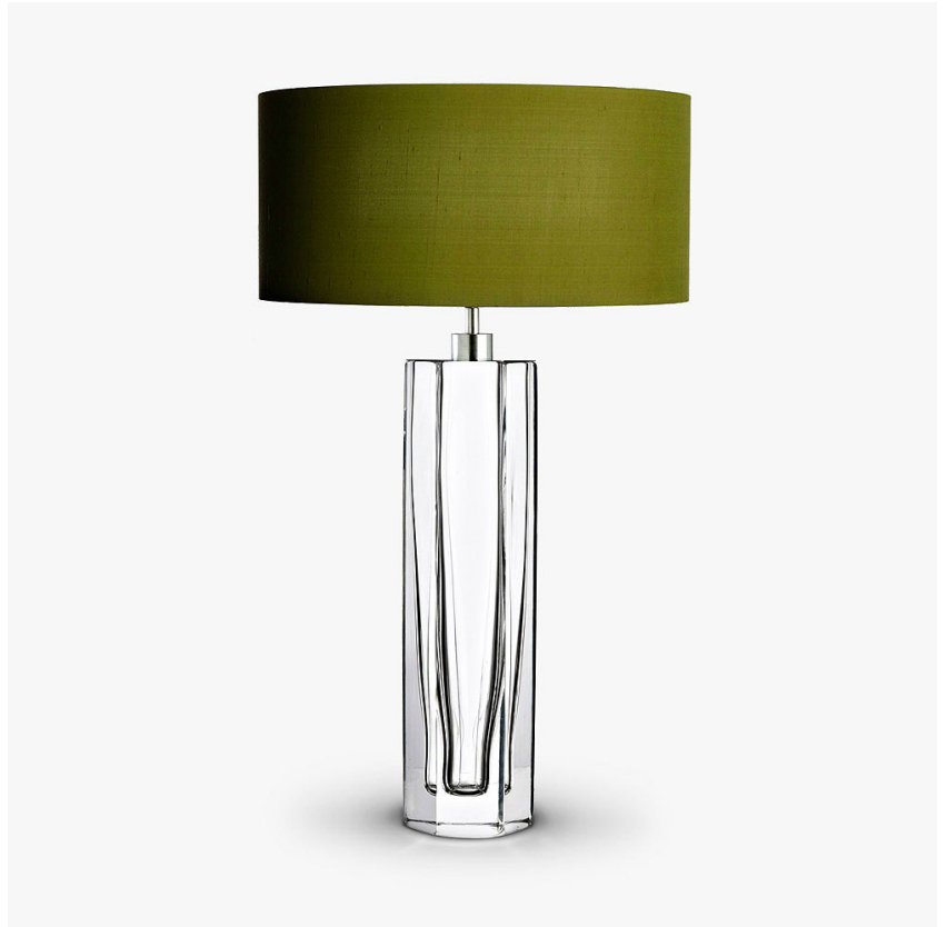
TL704 in Clear Murano Glass and Brushed Nickel with a 16" Short Drum Shade in 5018W/ 202