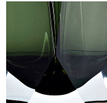
Forest Green & Clear