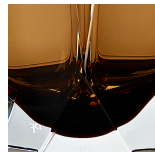
Tobacco & Clear