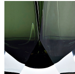
Forest Green & Clear