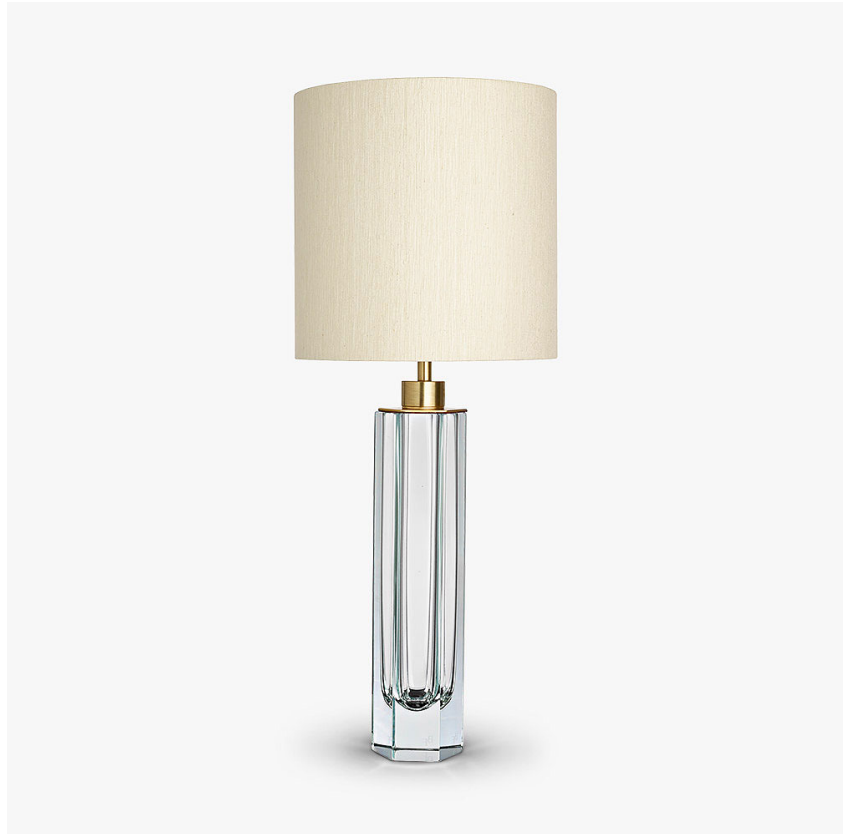
TL704-SM in Clear Murano Glass with Brushed Gold and 10" Tall Drum Shade