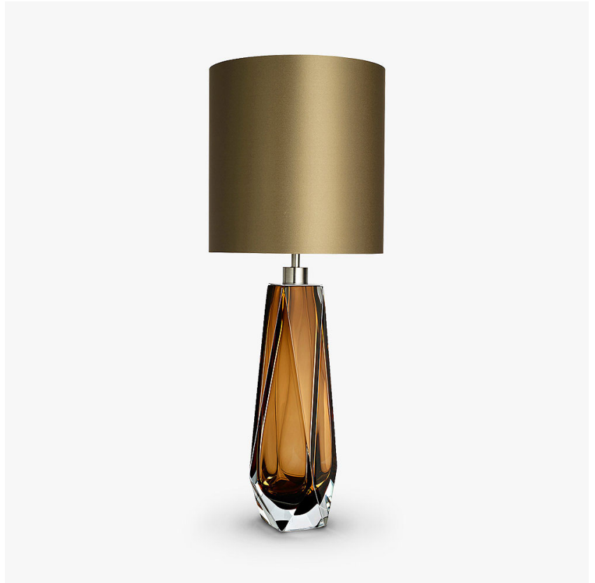
TL703-XL in Tobacco and Clear Murano Glass with Brushed Nickel and 13" Tall Drum Shade in 1806W/ Timber Wolf