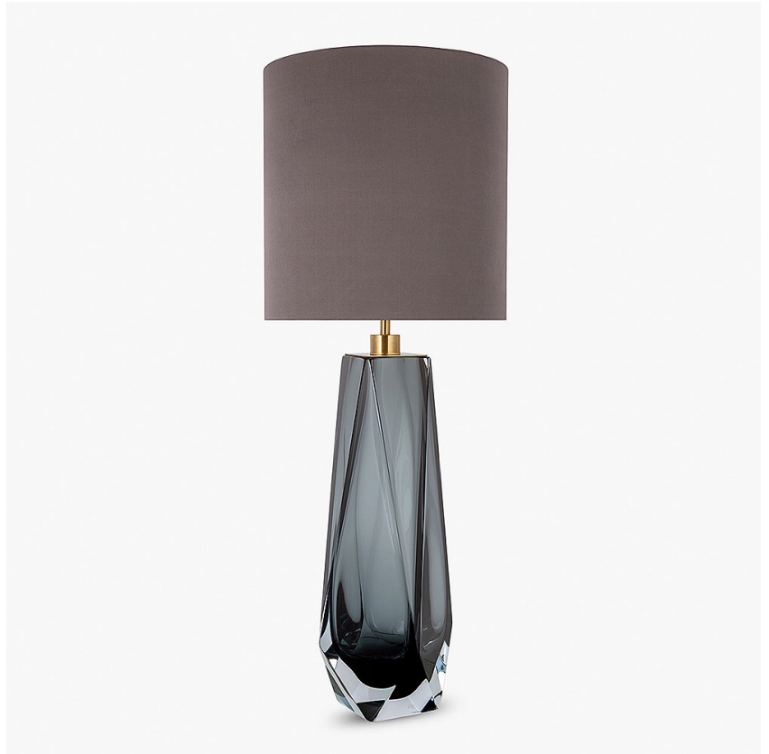
TL703-XL in Petrol Blue & Clear Murano Glass with a 13 Inch Tall Drum Shade in Silk Dupion 5018W/ 86