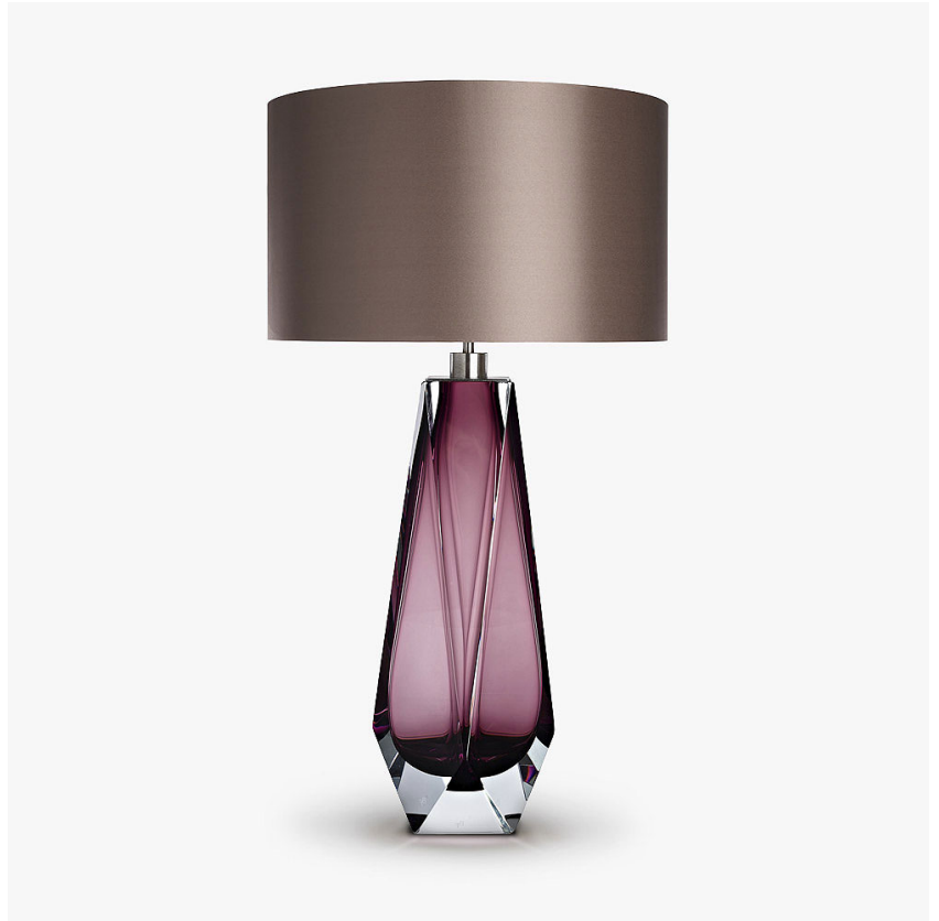
TL703-XL in Amethyst and Clear Murano Glass with a 17" Short Drum Shade in 1806W/ 102 Grey Plum