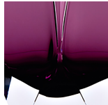
Amethyst & Clear