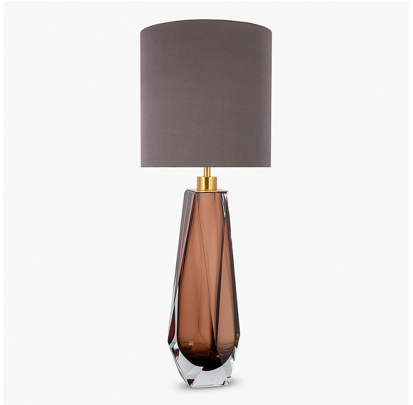
TL702 in Tobacco & Clear Murano Glass with a 11 Inch Tall Drum Shade in Silk Dupion in 5018W/ 86