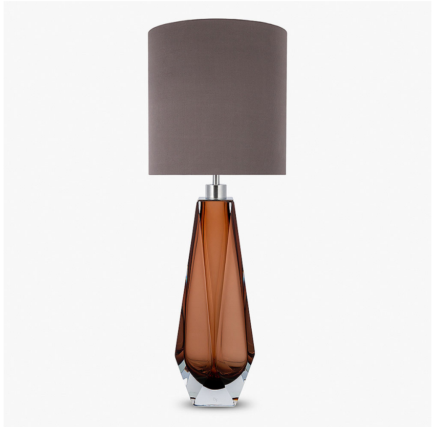
TL702 in Tobacco & Clear Murano Glass with a 11 Inch Tall Drum Shade in Silk Dupion in 5018W/ 86