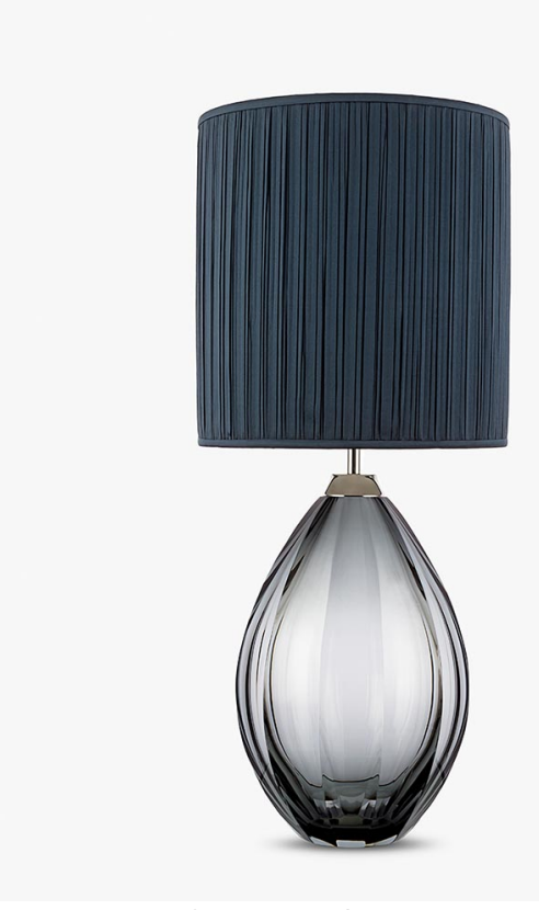
TL711-LA in Petrol Blue & Clear Murano Glass with a 12" Tall Drum Shade in James Hare 38000/135