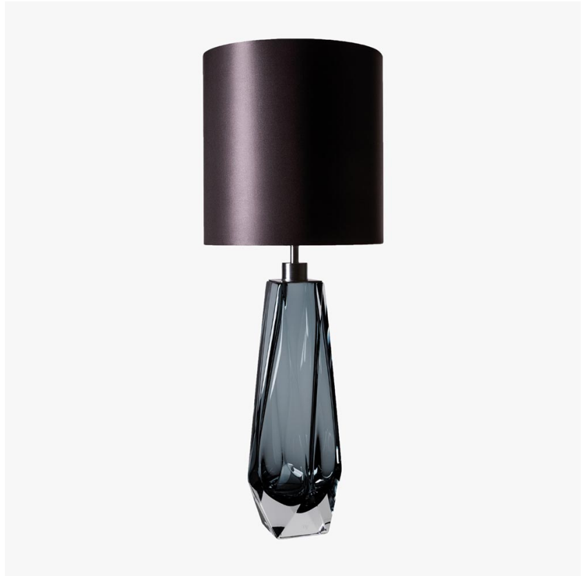
TL702 in Petrol Blue & Clear Murano Glass with a Brushed Nickel Top and 11" Tall Drum Shade in Silk Crepe Satin 1806W/ 86 Prussian