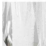
Diamond Clear Soda Glass