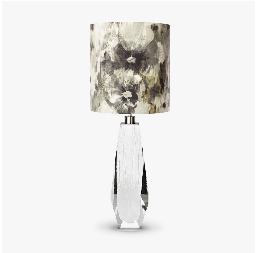
TL702 in Clear Murano Bubble Glass and Brushed Nickel with a 12 Inch Tall Drum Shade in a Custom Fabric by Romo