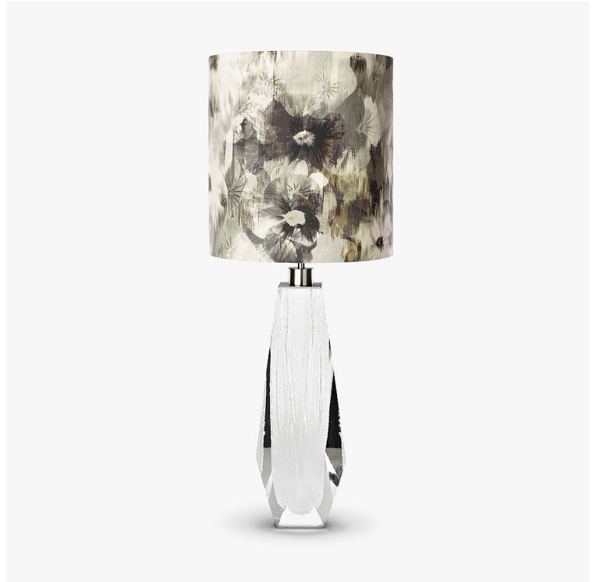
TL702 in Clear Murano Bubble Glass and Brushed Nickel with a 12 Inch Tall Drum Shade in a Custom Fabric by Romo