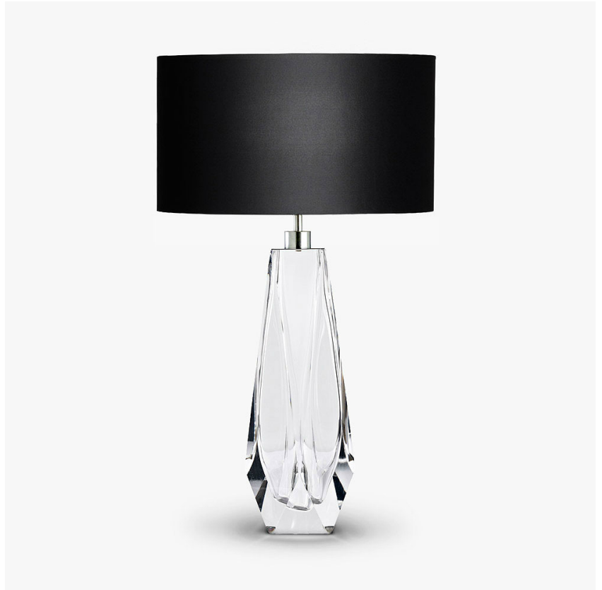
TL702 in Clear Murano Glass with a 15 Inch Drum Shade in Silk Crepe Satin 1806W/21 Slate