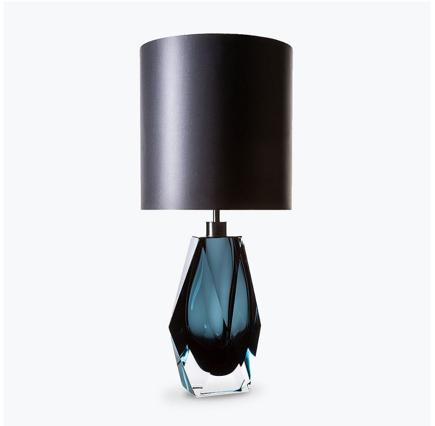
TL701 in Petrol Blue & Clear with Brushed Nickel Top with a 11" Tall Drum Shade in Silk Crepe Satin 1806W/ 86 Prussian