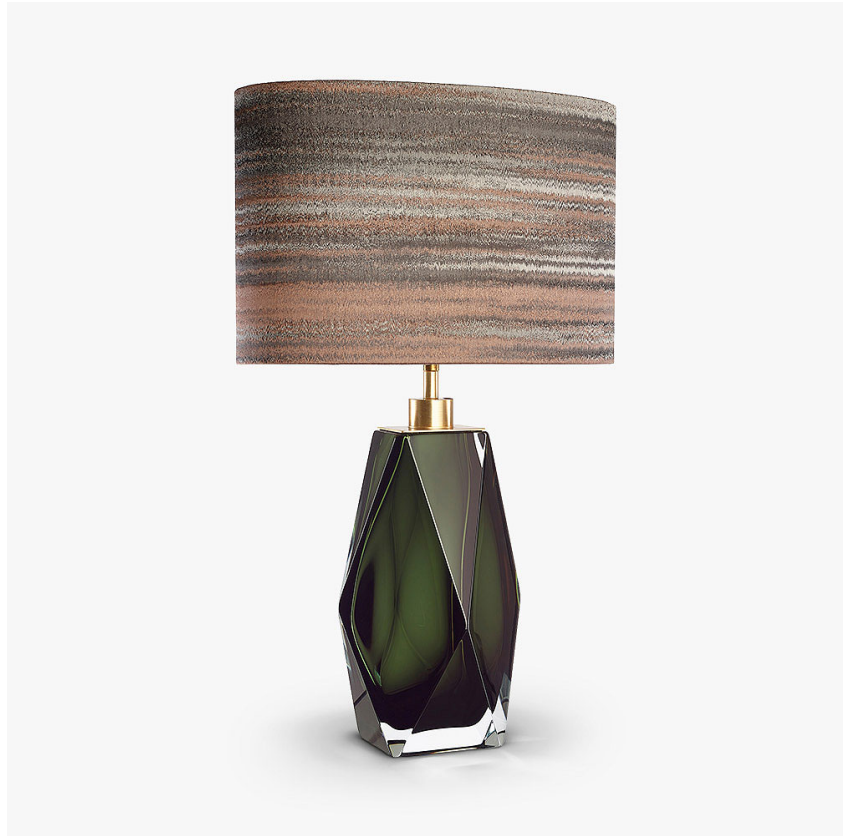
TL701 in Forest Green & Clear and Brushed Gold and an 15" Oval Shade in Romo Fabric