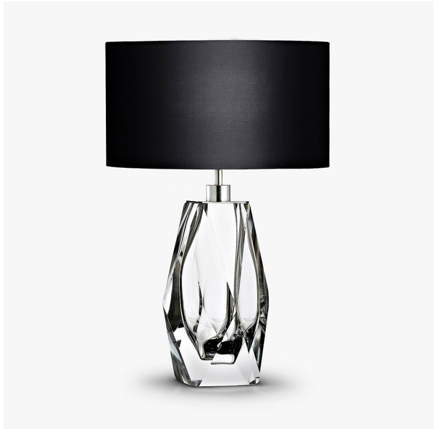
TL701 in Clear Murano Glass and Brushed Nickel with a 15 Inch Straight Oval Shade in Silk Crepe Satin 1806W/ 52 Black