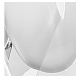
Satin & Clear