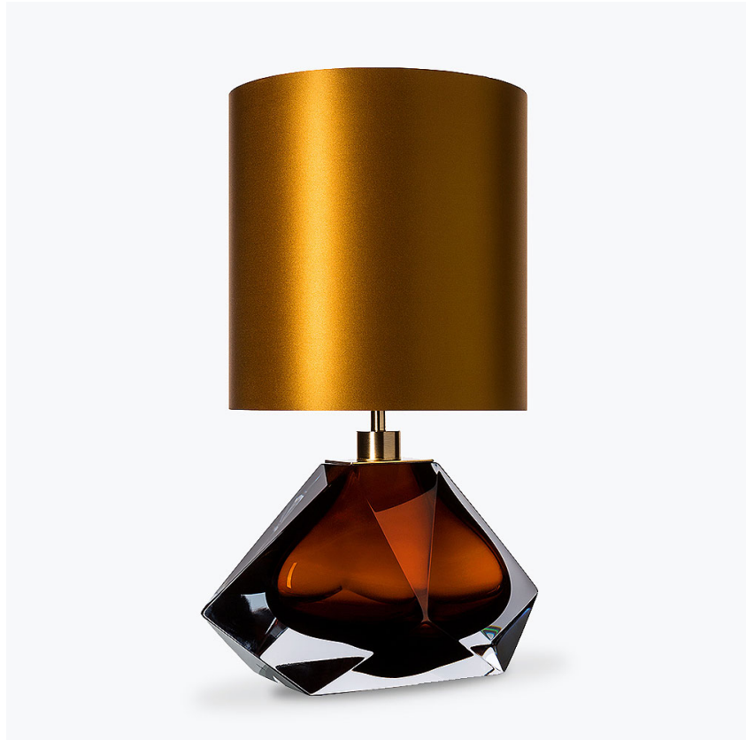
TL700 in Tobacco & Clear Glass and Brushed Gold with a 11" Tall Drum Shade in 1806W/ 70 Ochre