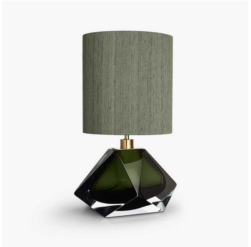
TL700 in Forest Green and Clear and Brushed Gold with a 11" Tall Drum Shade in Silk Linen 3998/ 0117 Vineyard Green