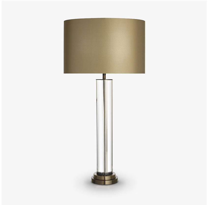
TL292 in Bronze and Clear Lucite with a 15 Inch Drum Shade in Silk Crepe Satin 1806W/ 216 Pebble