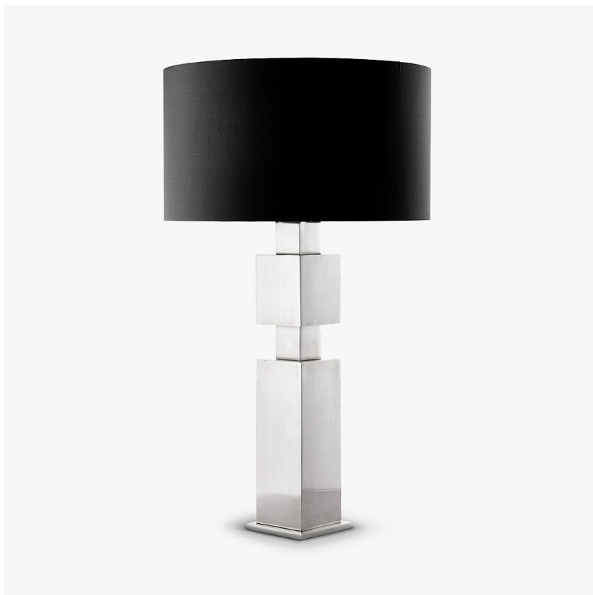
TL750 in Brushed Nickel with a 11 Inch Tall Drum Shade in Silk Crepe Satin 1806W/21 Slade

IEC (International Electrotechnical Commission) test certificates available - will incur a surcharge UL (Underwriters Laboratories) test certificates available for the USA - will incur a surcharge