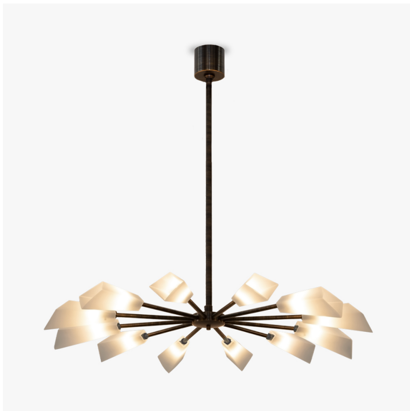
CL804-100 in Satin Glass and Antique Brushed Brass