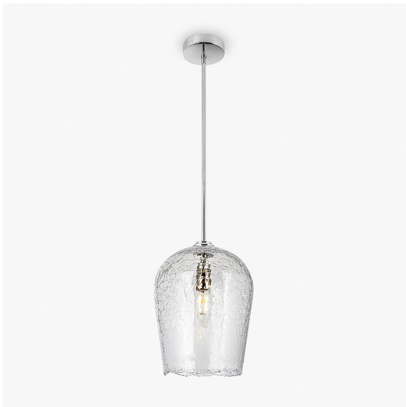
CL52 in Clear Crackled Glass on a Polished Nickel Rod

A classic pendant light with an artfully fractured edge and the crackled appearance of frozen ice, which encases the hand-blown glass beneath. Once lit, the refraction of light creates some truly exquisite patterns, which are unique to each pendant. Now available on a Polished Nickel rod.