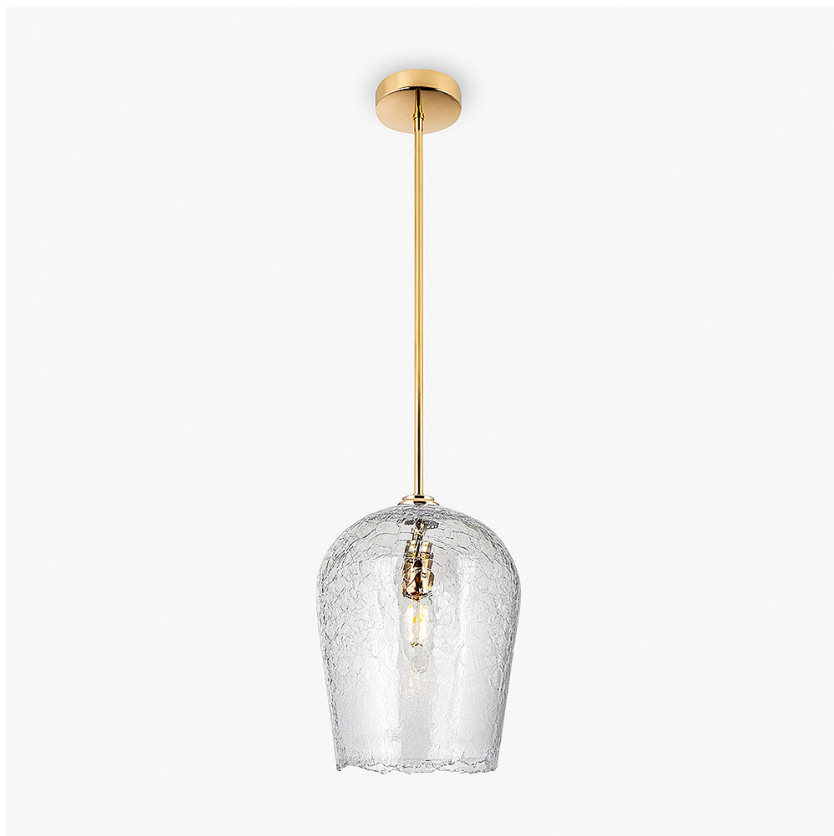
CL52 in Clear Crackled Glass on a Polished Gold Rod

A classic pendant light with an artfully fractured edge and the crackled appearance of frozen ice, which encases the hand-blown glass beneath. Once lit, the refraction of light creates some truly exquisite patterns, which are unique to each pendant.