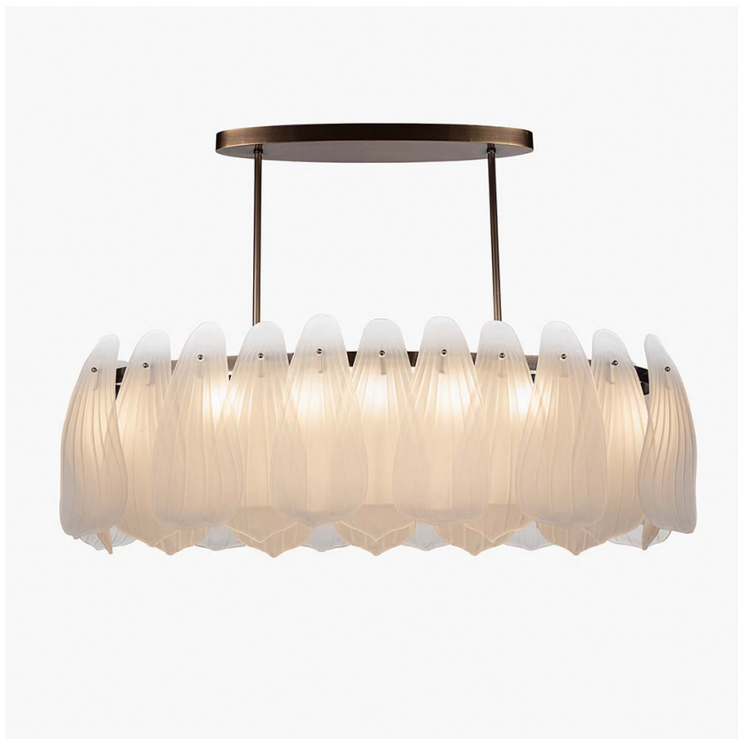
CL214-125 in Satin Glass and Brushed Light Bronze