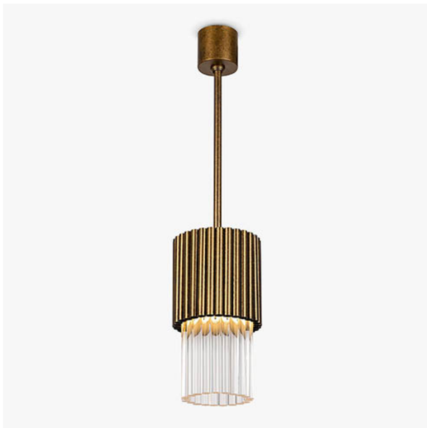
CL108-PEN in Clear Lucite Rods and Stippled Gold Rods