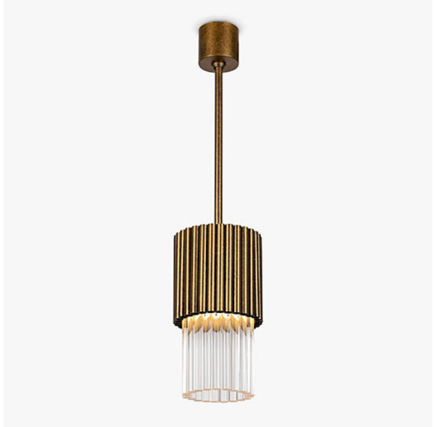
CL108-PEN in Clear Lucite Rods and Stippled Gold Rods