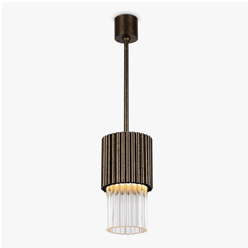
CL108-PEN in Clear Lucite Rods and Stippled Bronze Rods