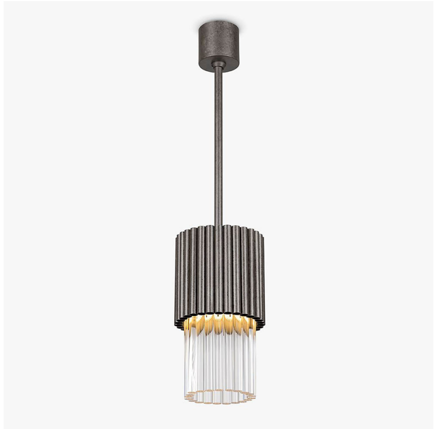
CL108-PEN in Clear Lucite Rods and Stippled Silver Rods