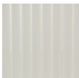
Frosted Lucite Rods