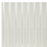
Clear Lucite Rods