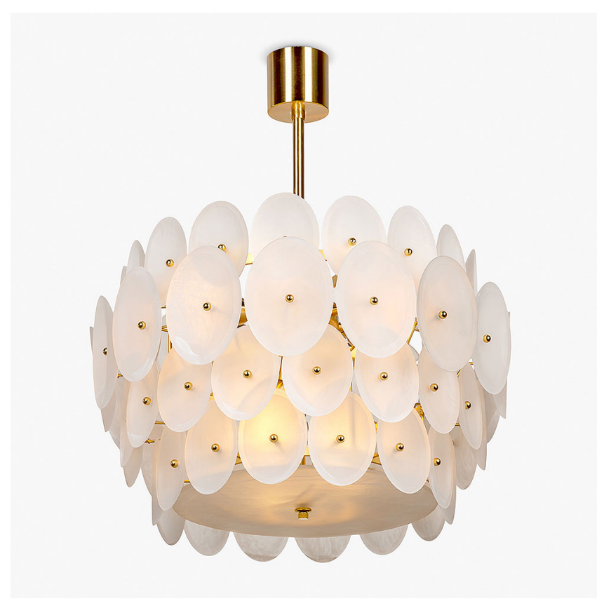
CL61-SM in Alabaster Glass and Brushed Gold