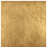
Antique Gold Leaf