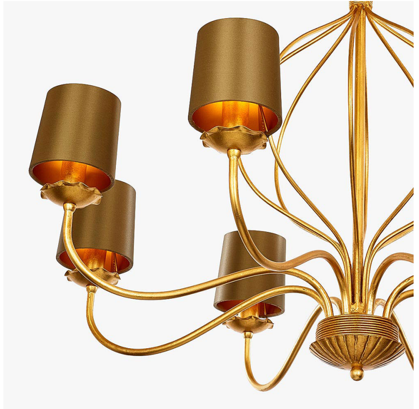
CL81-8 in Antique Gold with 5 Inch Melton Shades in Silk Crepe Satin 1806W/ 1012 Dust

IEC (International Electrotechnical Commission) test certificates available - will incur a surcharge UL (Underwriters Laboratories) test certificates available for the USA - will incur a surcharge