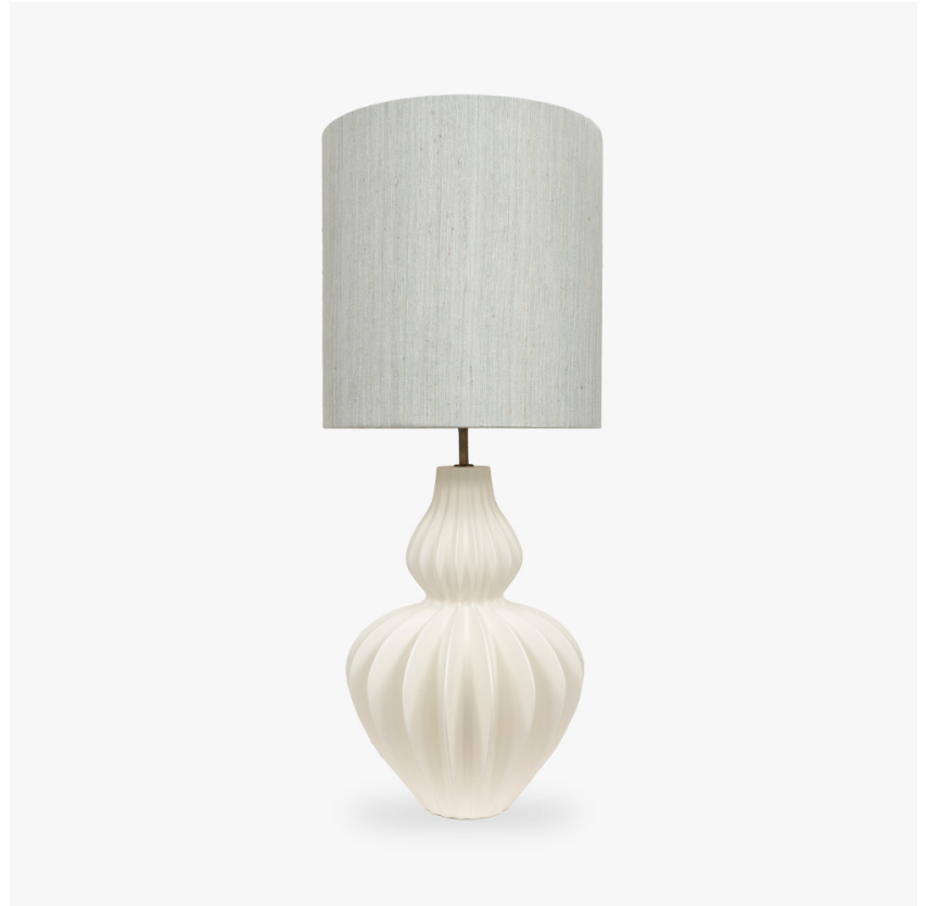
TL825 in Chalk and Old English Brass with 14" Tall Drum Shade in James Hare 31625-10 Vyne French Grey