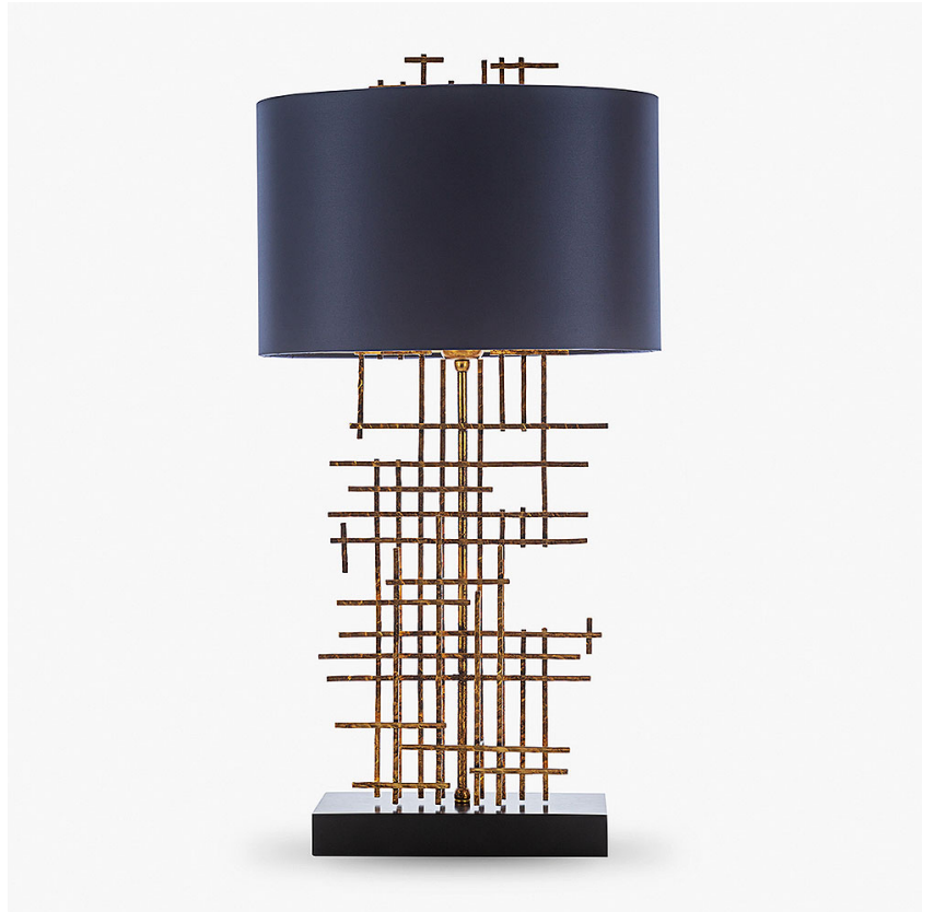
TL59 in Antique Gold Leaf with an Ebony Resin Base with a 15" Oval Drum Shade in Crepe Satin 1806W/ 86 Prussian