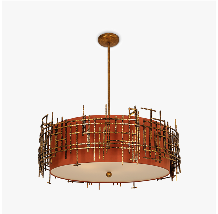
CL59 in Hammered Antique Gold Leaf with Shade in Dupion 5018W/553