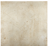
Antique Silver Leaf