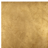
Antique Gold Leaf