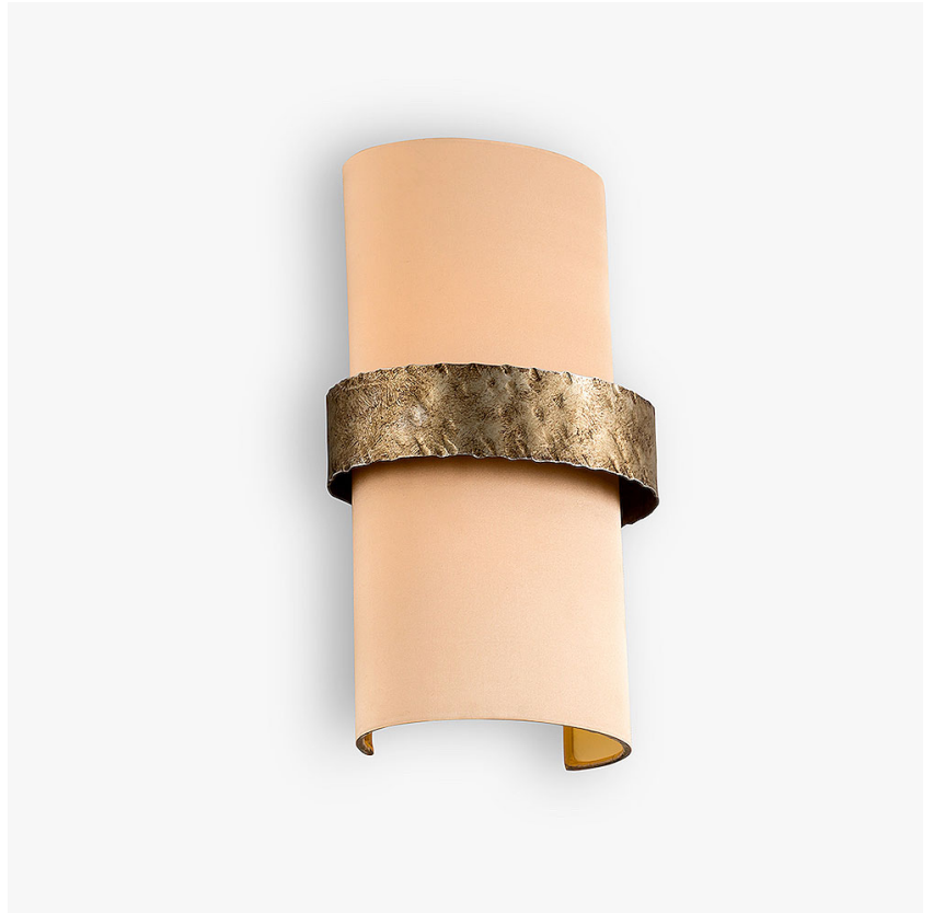
WL50 in Hammered Antique Silver with a Half Oval Shade in Crepe Satin 1806/W 68 Peach

The perfect pairing for our Milne Chandelier, the wall light is a simple but elegant metal band in which sits a long, curved shade which is available in over 280 shade silks. The metal band is available in four hand painted finishes and the choice of two metal textures - smooth or hammered.