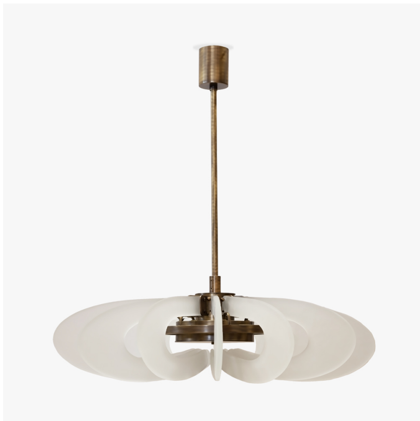
CL807 in Satin Glass and Brushed Dark Bronze

Vega's most daring design, the Magnetar ceiling light is the consequence of the discovery of a neutron star of the same name, a star which possess' powerful magnetic fields. The hand moulded glass fins visually represent the pulsating radio bursts emitted by this star. Unlike anything Bella Figura has ever created, this sculptural light conceals an integrated LED light source which emanates an ethereal glow from within.