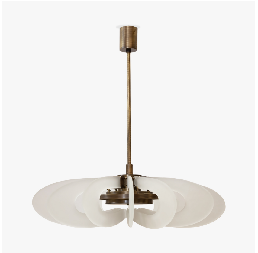
CL807 in Satin Glass and Brushed Dark Bronze

Vega's most daring design, the Magnetar ceiling light is the consequence of the discovery of a neutron star of the same name, a star which possess' powerful magnetic fields. The hand moulded glass fins visually represent the pulsating radio bursts emitted by this star. Unlike anything Bella Figura has ever created, this sculptural light conceals an integrated LED light source which emanates an ethereal glow from within.