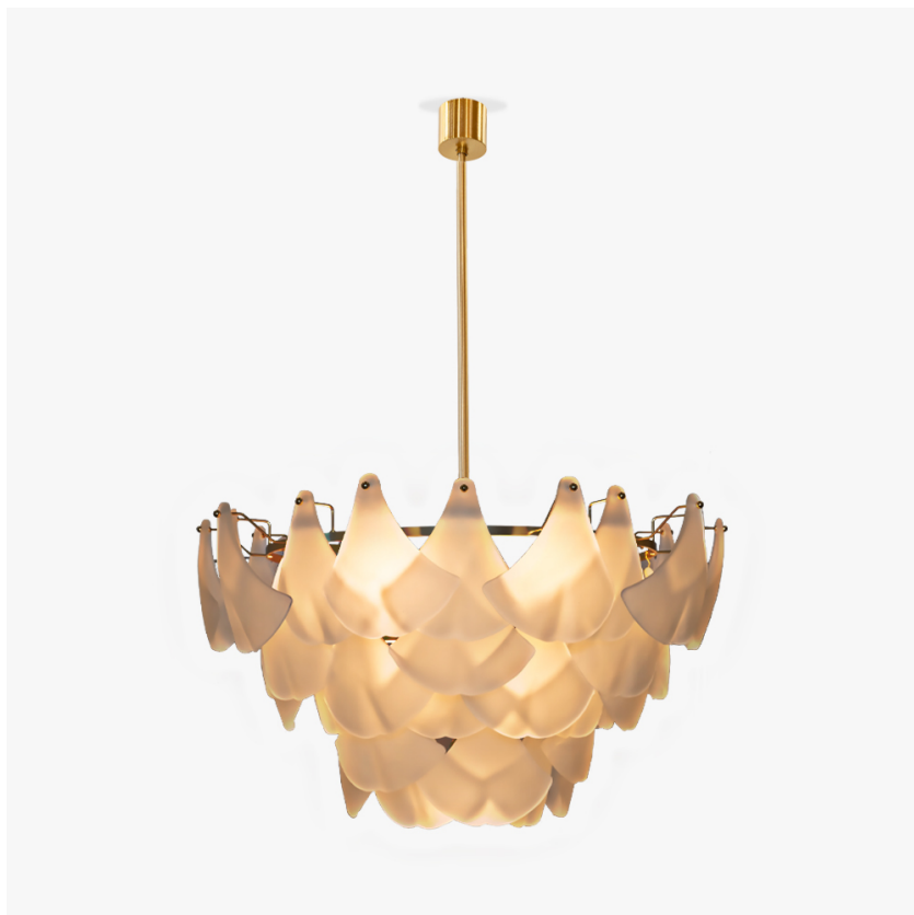
CL802 in Satin & Polished Gold