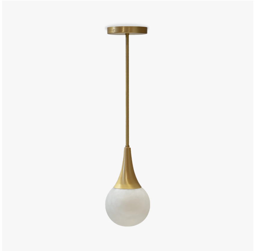
CL808-SM in Alabaster and Brushed Gold