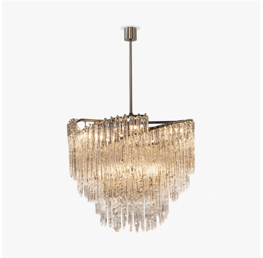
CL800-2T-75 in Clear and Brushed Nickel