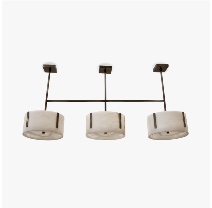
CL805 in Alabaster and Bronze