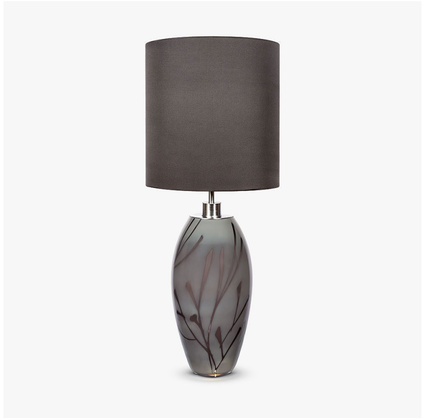
TL220 in Mineral Grey and Brushed Nickel with 11" Tall Drum Shade in Silk Crepe Satin 1806W/ 1021 New Platinum

Suspended within layers of glass lies an energetic and gesturally carved pattern; the intricacies of which come alive when introduced to light. Wisps of clear glass peek through a blend of melting colours, drawing the gaze through the layers to a mesmerising play of movement. Entirely hand made in England with the complex Swedish "graal" technique, each piece takes up to six hours to create and will command centre stage in any room