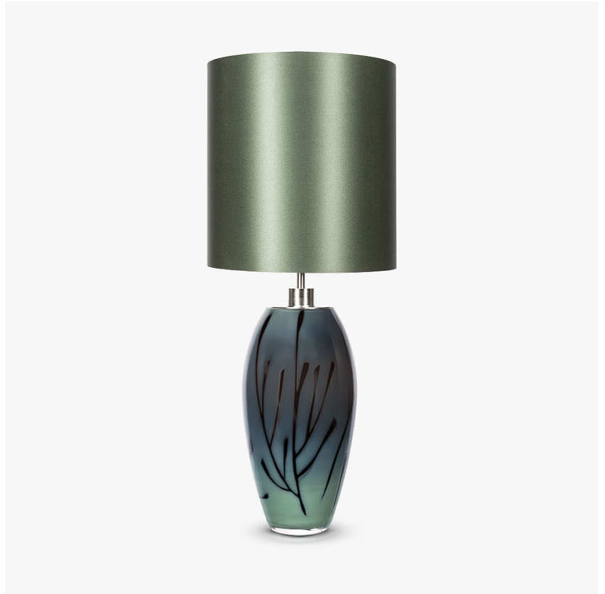
TL220 in Storm Blue and Brushed Nickel with 11" Tall Drum Shade in Silk Crepe Satin 1806W/ 408 Shaded Green

Suspended within layers of glass lies an energetic and gesturally carved pattern; the intricacies of which come alive when introduced to light. Wisps of clear glass peek through a blend of melting colours, drawing the gaze through the layers to a mesmerising play of movement. Entirely hand made in England with the complex Swedish "graal" technique, each piece takes up to six hours to create and will command centre stage in any room