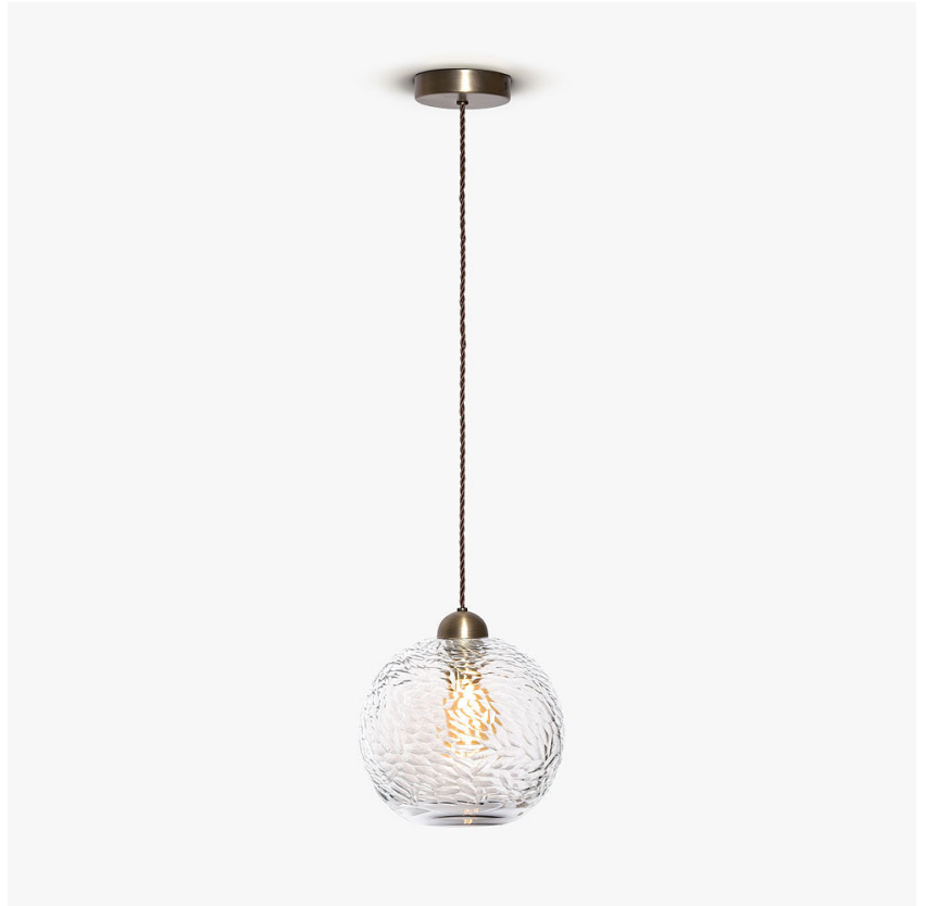
CL376 in Clear Battuto Lead Crystal and Brushed Dark Bronze and Brown Flex

The finest quality English lead crystal is carved in a fashion that mimics the patterns etched into the weather beaten walls of glacial caves. Drawing on the Murano glass craft of 'Battuto' whose name itself derives from the Italian word for 'beaten', our Glacier pendant and table lamp have every facet carved out individually by our English crystal experts. Use them individually or make use of our customisation service to group several together for a completely individual look.